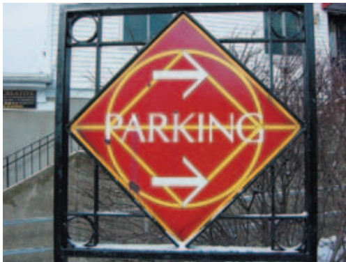
A sign on South Street indicating a nearby parking lot.