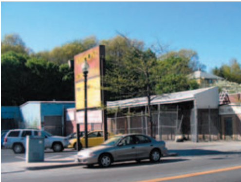
Below: The vacant building that formerly housed the Ashmont Discount store