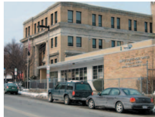
The Roslindale Community Center and the post office at the intersection of Cummins Highway and Washington Street

Roslindale’s diversity can be seen through the variety of goods, services, and community organizations that are clustered throughout the district. The analysis map of the physical uses show how the village serves the needs of a variety of groups, including residents, visitors, commuters, children, and the elderly. The map shows where use is concentrated or where overlaps in use take place. An analysis of usage patterns identifies Washington Street as a possible barrier for some groups and highlights how this major arterial road divides the district in two.