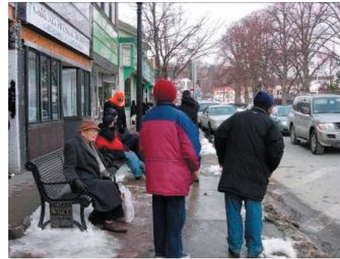
People awaiting the bus at the corner of Poplar and Corinth Streets.