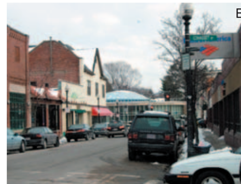
B. The Roslindale Branch Public Library completes a vista down Corinth Street