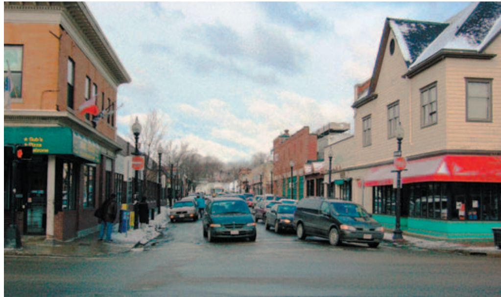
A view of Corinth Street from the Washington Street intersection

“a district or group of districts or a subdistrict or group of subdistricts or parts thereof (hereafter referred to as an area) may be established as an interim planning overlay district when it is determined by the Zoning Commission that: (1) the existing zoning is thought to be inappropriate; (2) a rezoning of the area is anticipated; (3) a comprehensive planning study preceding the anticipated rezoning is needed; and (4) interim land use regulations are essential