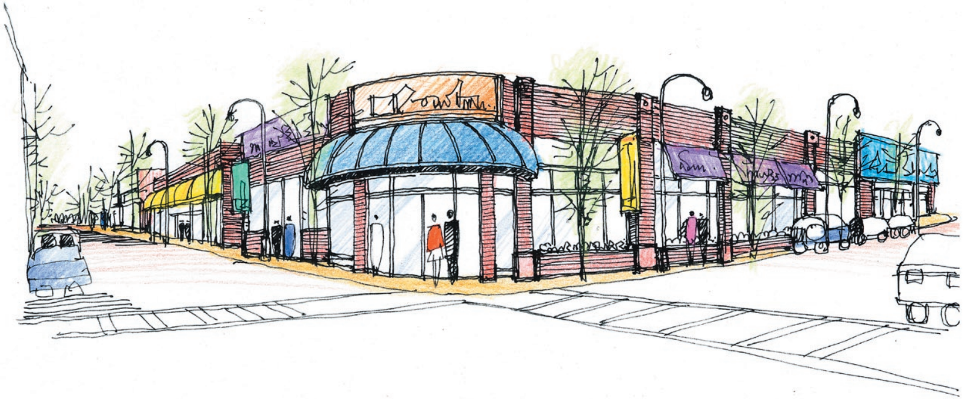
Vision for potential development at the corner of Corinth & Birch Streets