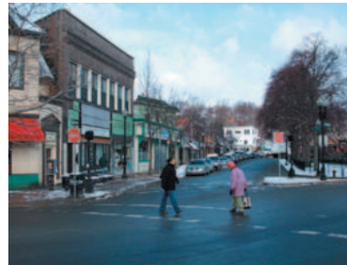
Pedestrians crossing Washington Street