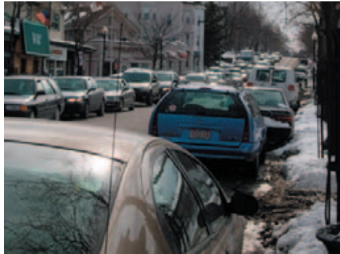
Curbside parking along Washington Street, facing south.

Rather than park in lots, drivers in Roslindale Village choose to park on the street as close to their destination as possible. Due to the high demand for on-street parking, this often means that drivers circle the village looking for parking (while adding to traffic and pollution), only to park further from their destination than the nearest available lot. The on-street parking problem is exacerbated by day-long users, such as employees and commuters, who park on the street. Additionally, many drivers in Roslindale Village are unaware of public parking locations or are uncomfortable leaving their cars in the lots.