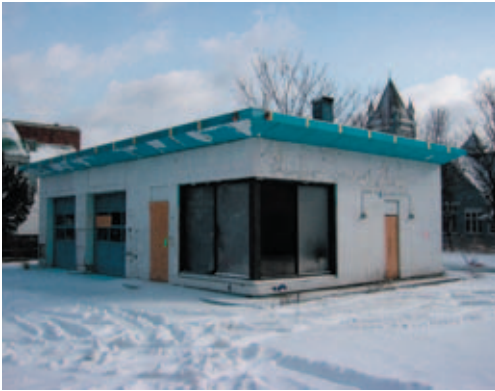
Above: The unoccupied former gas station on Washington Street