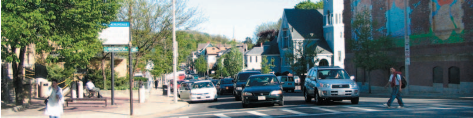
Above: Cars turning from Cummins Highway onto Washington Street.