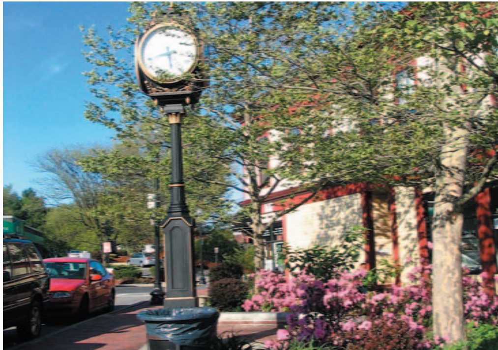
Left: Clock tower at corner of South & Birch Streets.

Sense of place is a key element for both visitors and residents. Roslindale Village is fortunate to have a wide variety of physical attributes, including landmarks, open spaces, and views that visitors and residents use to identify the fact that they are within the Village. Highlighting these physical landmarks strengthens Roslindale's identity as a unique place and will provide a starting point for even greater physical definition of Roslindale Village. A positive image of Roslindale can encourage visitors to return and enhance the quality of life for residents.