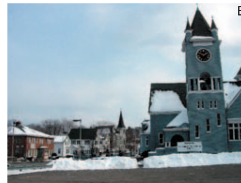
E. The prominent steeple of Sacred Heart Catholic Church