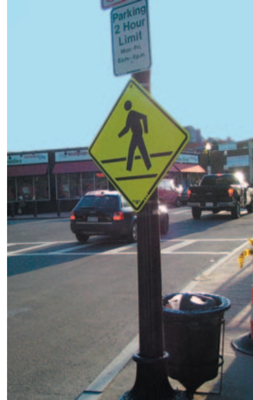
Below: A pedestrian crossing sign on Birch Street.

Traffic circulation around Adams Park negatively impacts the village feel and pedestrian experience. Buses that stop along Washington Street significantly congest the traffic flow within Roslindale Square. A circulation pattern that uses the roadway perimeter around Adams Park as a rotary exacerbates the district's congestion problems. The otherwise picturesque park and its surrounding businesses lose their pedestrian appeal because of the danger associated with the traffic that runs counterclockwise around the park. Furthermore, pedestrian deaths have occurred on South Street.