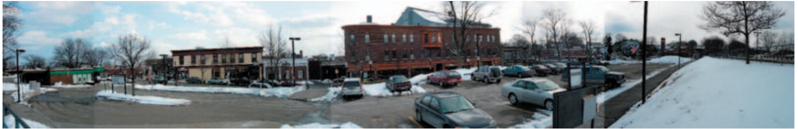
A view of the MBTA Commuter Rail parking lot, facing Belgrade Avenue.