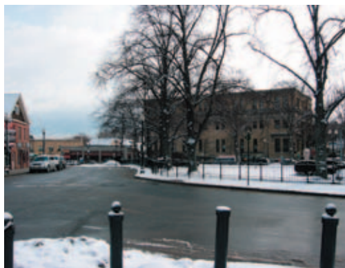
Above: Perimeter of Adams Park along Poplar Street in winter.