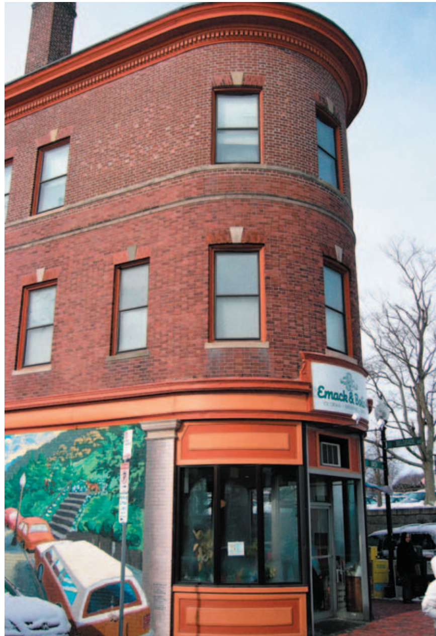
Left: Corner of a triangular building that houses Emack & Bolio's

A wide range of landmarks combines with Roslindale Village's irregular street grid to create a series of street views that continually reveal the unique elements of the Village. For example, as one walks or drives down Corinth Street, Alexander the Great Park marks the entry into the Village, two murals further define the Village, and the blue roof of the Library helps people orient themselves in the Village. While this series of unique views invites the pedestrian to explore Roslindale Village, a series of public spaces provide an important opportunity to linger. While Adams Park is the most visible of these spaces, smaller public spaces also provide hidden jewels for the visitor to discover and allow for a more intimate experience of the neighborhood. These unique street views and public spaces provide a backbone of positive physical attributes that can be expanded to strengthen Roslindale's distinct character and unique identity.