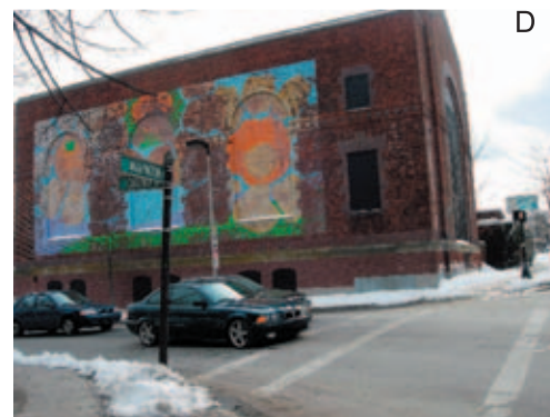
D. View of a mural on the historic MBTA station