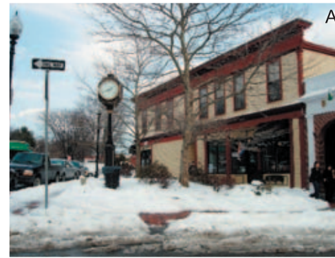
A. A small landmark, the clock tower at South and Birch Streets.