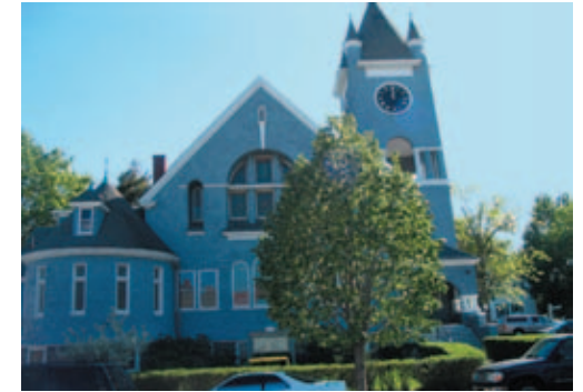
Right: Notable façade of Sacred Heart Catholic Church.

Smaller landmarks distinguish the Village as a one-of-a-kind place, in sharp contrast to common commercial landmarks (such as McDonalds' golden arches) that can be found anywhere throughout the city. These smaller landmarks also create pedestrian-scaled reference points within the Village, allowing, for example, a group of friends to meet up "by the clock on the corner."