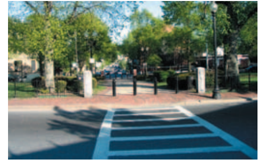
Right: A pedestrian crosswalk leading into Adams Park