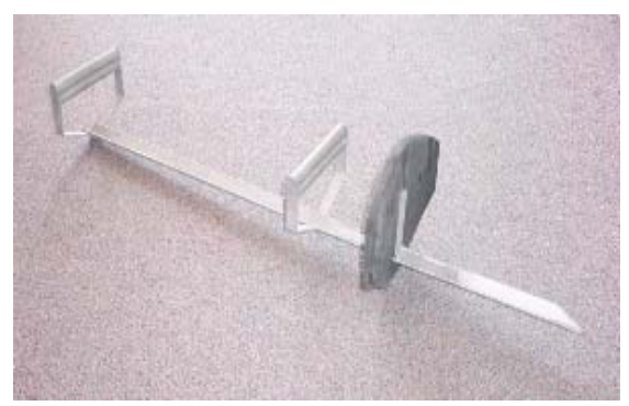
Figure 2. The D-handle pick prod.