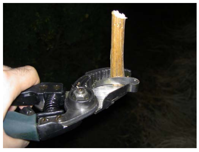
Picture 7: Pictures from field tests. From left to right: a depiction of branches classified as thin and thick, with a pen as a reference; a cantilever spring gripper is demonstrated with the Corona CH7720 pruner.