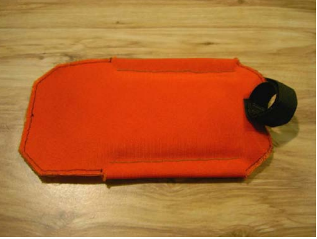
Picture 4: Handshield design for the clipper. From top left clockwise: the back view, with the pouch visible; the front view; the handshield incorporated into the clipper; the handshield in actual use.