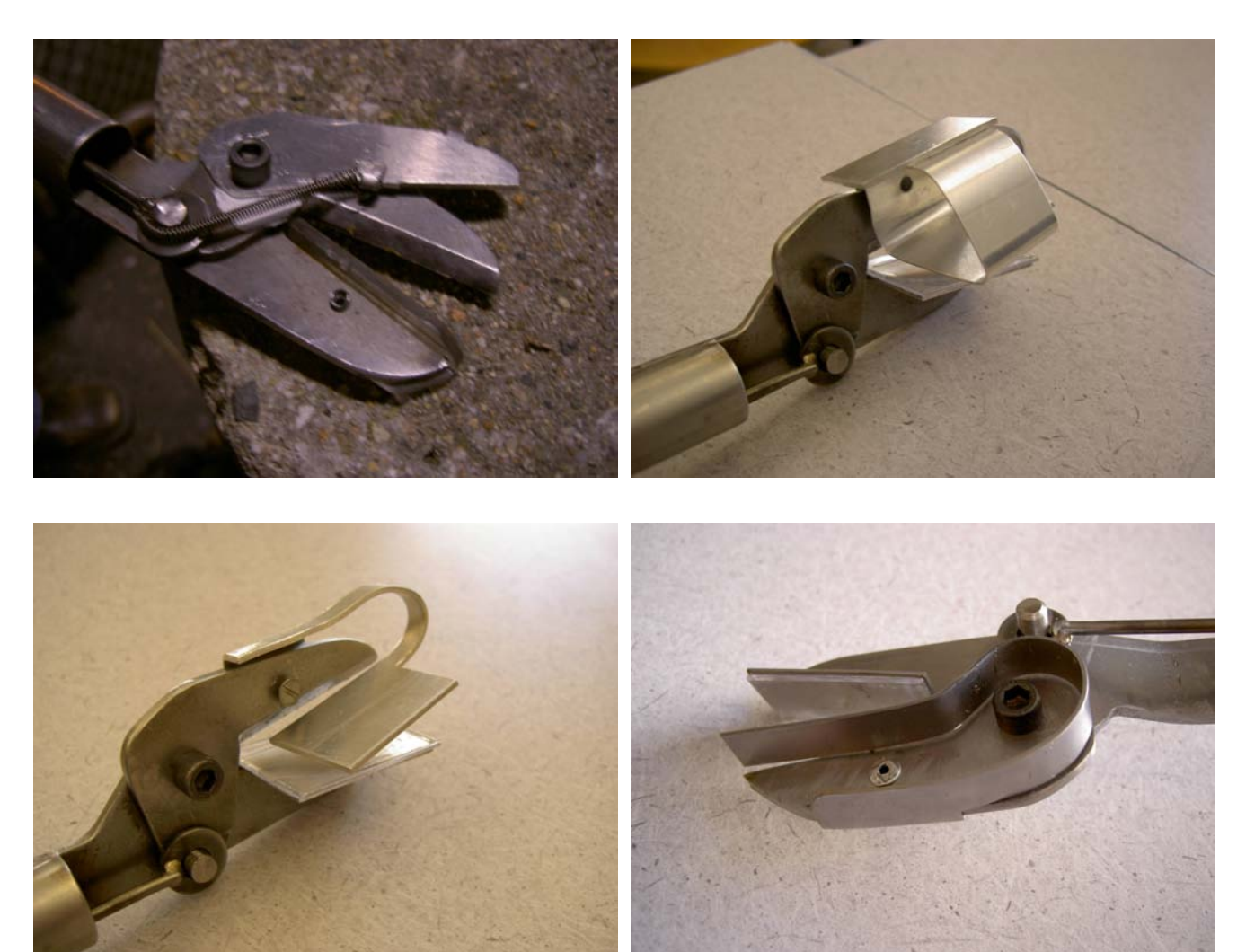
Picture 5: Various gripper design proposed. From top left clockwise: a coil-spring actuated gripper, a vertical cantilever spring gripper, a horizontal cantilever spring gripper that wraps out backward, and a regular horizontal cantilever spring gripper.