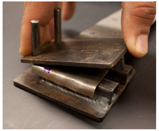
Sheet metal corn sheller forming jig.