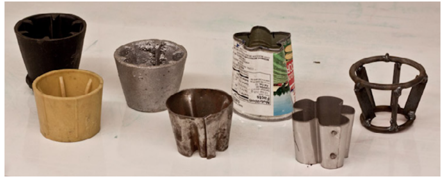
Varieties of corn shellers using different materials and methods.

These materials are provided under the Attribution-Non-Commercial 3.0Creative Commons License, <a href="http://creativecommons.org/licenses/by-nc/3.0/">http://creativecommons.org/licenses/by-nc/3.0/</a>. If you choose to reuse or repost the materials, you must give proper attribution to MIT, and you must include a copy of the non-commercial Creative Commons license, or a reasonable link to its url with every copy of the MIT materials or the derivative work you create from it.