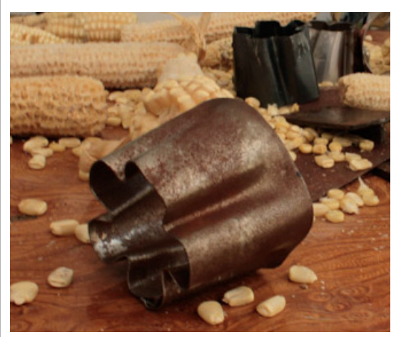
Sheet metal cornsheller and shelled corn.