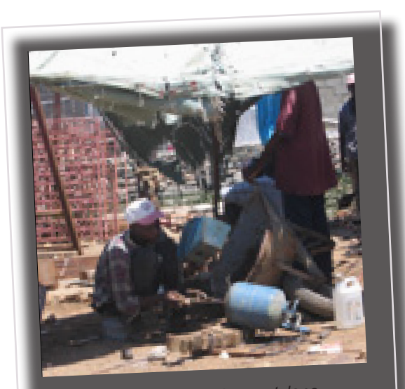
Fig 3a Welding in Haiti: Oxyacetylene welding in a village without electricity

Be sure to use protective clothing and goggles, as the radiation and extreme light can be dangerous to your skin and eyes