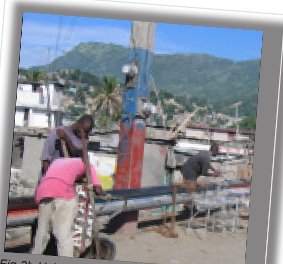
Fig 3b Using electricity from utility pole to arc weld on the side of the street

These materials are provided under the Attribution-Non-Commercial 3.0Creative Commons License, http://creativecommons.org/licenses/by-nc/3.0/. If you choose to reuse or repost the materials, you must give proper attribution to MIT, and you must include a copy of the non-commercial Creative Commons license, or a reasonable link to its url with every copy of the MIT materials or the derivative work you create from it.