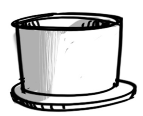
Fig 2b Overhang endplate configuration