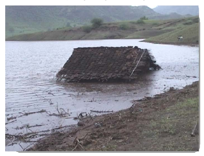
© Friends of River Narmada. All rights reserved. This content is excluded from our Creative Commons license. For more information, see <a href="http://ocw.mit.edu/fairuse">http://ocw.mit.edu/fairuse</a>.

There are governments of various levels that have overlapping responsibilities concerning dam construction. Water provision is often done by state governments, but the federal government has control over interstate water systems. Resettlement is managed by state governments because they have control of land allocation, but the federal government answers to international donors such as the World Bank. It is not easy to get political consensus in a country that diverts political structure. In 1979, there was a progressive tribunal ruling that said for the first time that people displaced by the construction would receive land for land, as opposed to cash compensation. This is significant for a country with a substantial rural population that depends on land for cultivation. Cash is much harder for them to utilize, and many people who receive cash end up migrating and living with the urban poor.