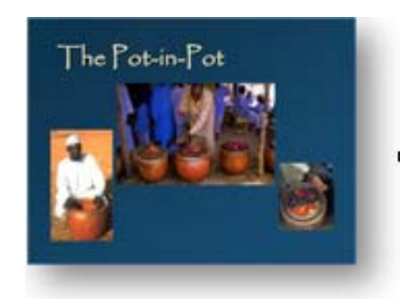
Photos © Rolex Awards for Enterprise. All rights reserved. This content is excluded from our Creative Commons license.For more information, see http://ocw.mit.edu/fairuse.

Another commonly cited example of appropriate technology is the pot-in-pot evaporative cooler. It works by having a pot within a pot, separated by a layer of dirt that can be moistened, so the interior is cooled as the water evaporates. In these pots, vegetables can last 2-3 weeks without refrigeration instead of just a few days, enabling households to store food longer. The coolers also enable farmers to wield more negotiating power and command better prices in the market by helping to reduce the pressure to sell before the vegetables go bad. Local potters can be trained to make these "desert refrigerators," but the key word is "desert" because this technique works much better in areas of low humidity. The pot-in-pot coolers do not work as well during the wet season or in certain climates, and can be difficult to transport. In Nigeria, a teacher from a family of potters