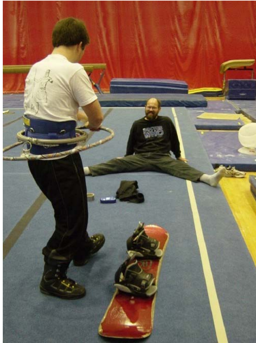
Tyler: Snowboard Training Harness

Simple single-point shockcord harness system allows dryland training of aerial snowboarding skills.