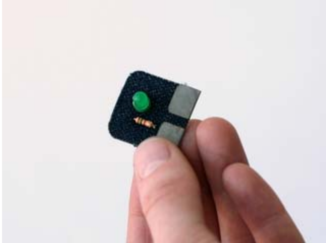
Step 5. Test with power supply.