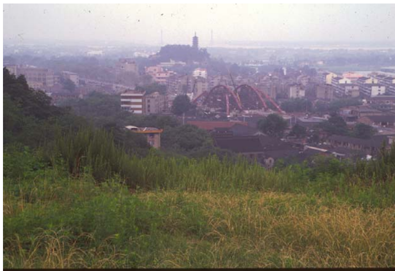
Zhènjiāng, xiàtiān hěn mēn! [JKW 1996]