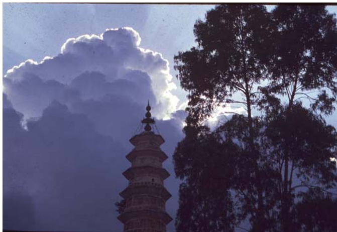
Clouds over one of the Sān Tǎ '3 Pagodas' in Dàlǐ, Yúnnán. [JKW 1993]

A large number of Mainland cities have zhōu as their second syllable: Sūzhōu , Hángzhōu , Xúzhōu , Lánzhōu , Fúzhōu , Chángzhōu , Yángzhōu , Guǎngzhōu , Gànzhōu etc. In old China, zhōu was an important administrative unit.