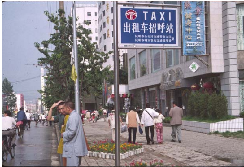
Zánmen dǎ ge dī qu, hǎo bu hǎo?