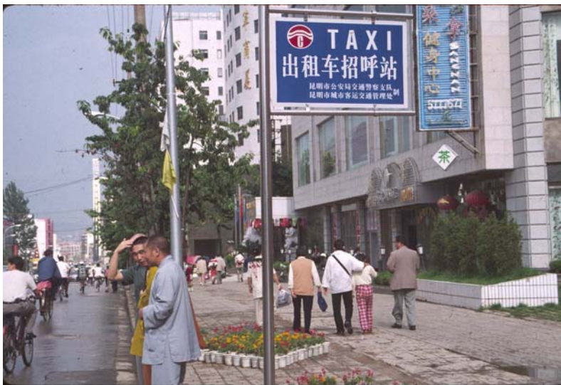
Zánmen dǎ ge dī qu, hǎo bu hǎo?