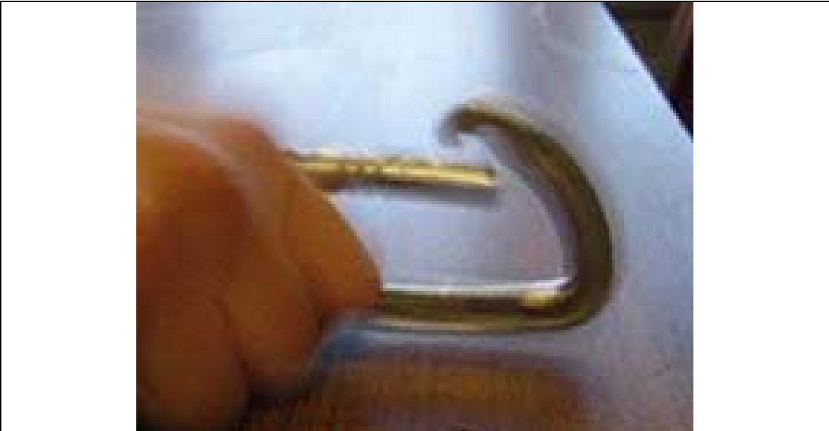
Figure 2 Video frame with carabiner gate open