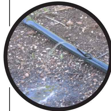
Simple knotted-tube emitters control the water flow rate.