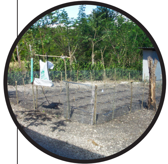
A small garden in Haiti equipped with one of IDE's drip irrigation systems.

Conventional drip irrigation systems cost between $1,200 and $3,000 per hectare (10,000 m 2 ), which makes them inaccessible to small-scale farmers in developing countries. The low-cost drip systems available from International Development Enterprises cost less than $500 per hectare and are available in a variety of sizes, ranging from the home garden kit, which costs only $2.50 and covers a plot of 20 m 2 , to a large custom system that costs $45 for 1,000 m 2 . Designed with affordability as the driving factor, the kits uses thin-walled flat plastic tubing and simple knotted-tube emitters and will last 1 to 2 years.