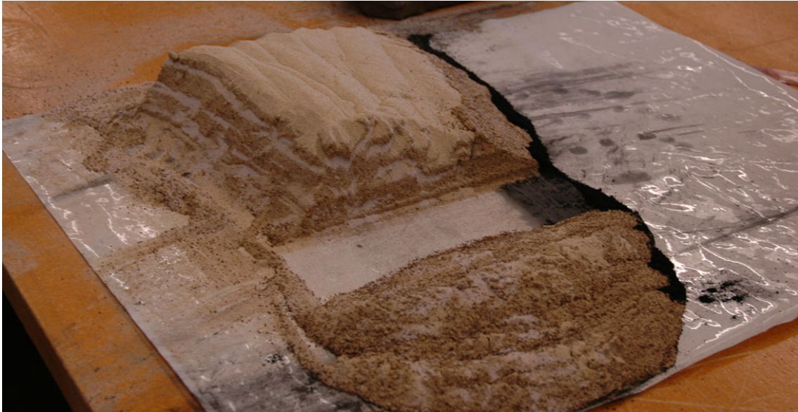
Figure 1: Table top fold and thrust belt produced in a sandbox. Wedge was sectioned, revealing a classic thin skinned fold and thrust deformational style, albeit on a smaller scale than, say, the Canadian Rockies.

thinning of the original package of sediment. Numerous tear faults formed were the sediment package thinned laterally.