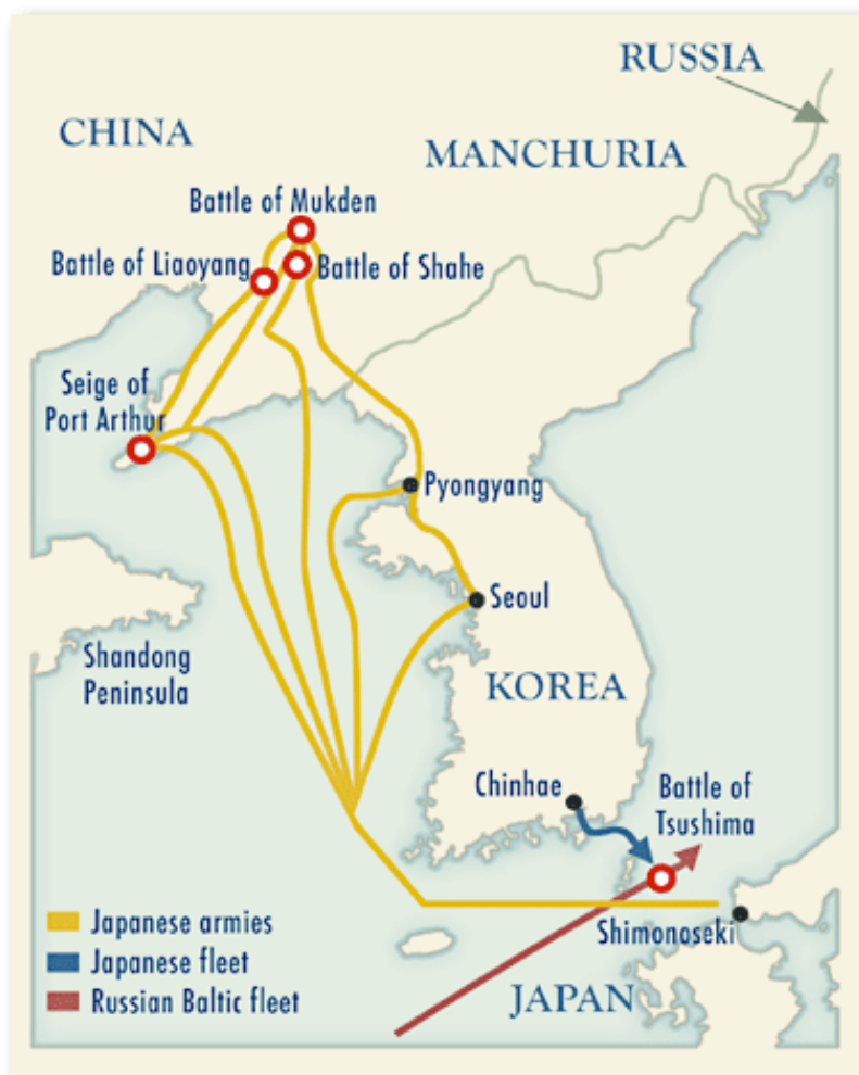
The Russo-Japanese War began in February 1904 and ended in September 1905.

(Japan formally declared war two days later.) Japanese armies fought their way through Manchuria and down the Liaotung Peninsula, eventually sinking the bottled-up Russian fleet from surrounding mountaintops with the largest artillery ever used in modern