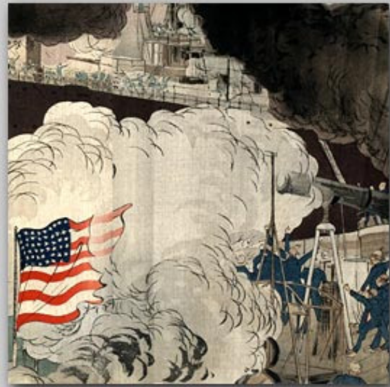
"Battle of Manila, May 1, 1898," artist unidentified (with details)

[res.54.160] Museum of Fine Arts, Boston