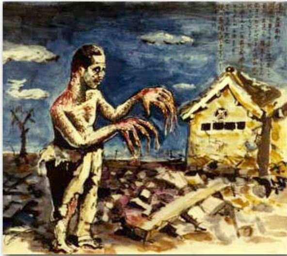
A man, skin peeling from his hands, “desperately looking for his child.” Neither the man nor his child survived.