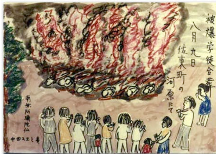
NAKATA Suemi 33 years old in August 1945 [45_15]

30 years later, the final, unbearable, unforgettable fire some survivors depicted involved cremating their children or witnessing the collective cremation of classmates, neighbors, or kin.