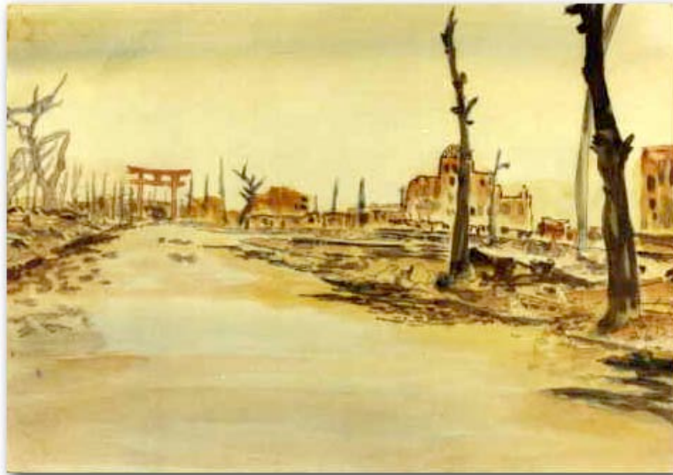
Downtown Hiroshima in ruins, as seen two weeks later.