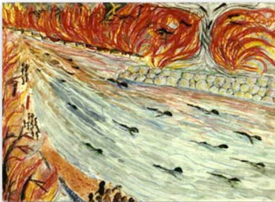
“Corpses floating in the river.”