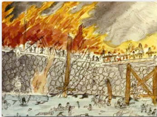
People leaping into the river at Sumiyoshi Bridge, 1,450 meters from the hypocenter.

Many were already injured, and few survived. The rivers became choked with bodies—carrying them out to sea and then, when the tide turned, bringing some of them back again.