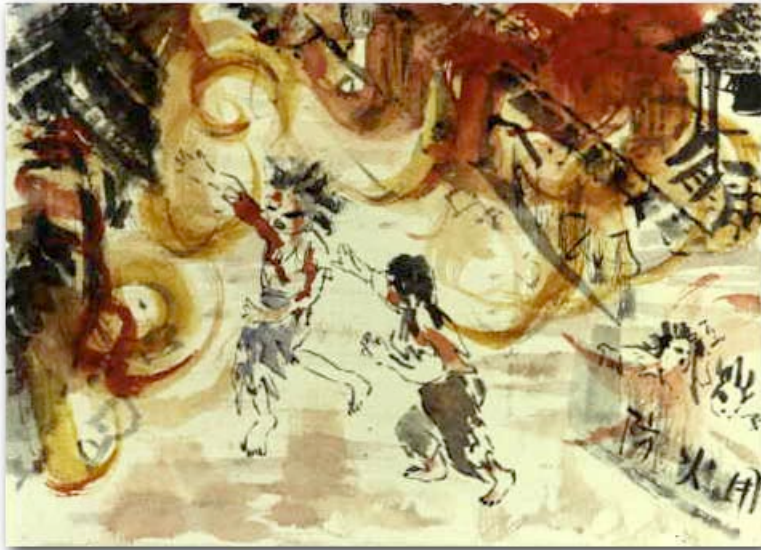
The artist and an injured girl attempting to escape “a sea of flames.”

On viewing images of a potentially disturbing nature: click here.